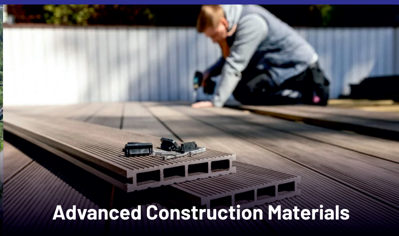
Advanced Construction Materials