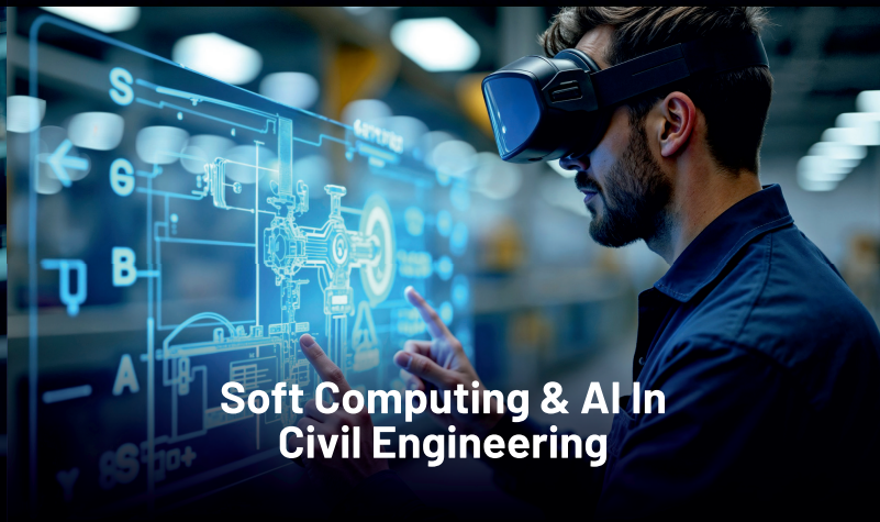
Soft Computing & AI In Civil Engineering