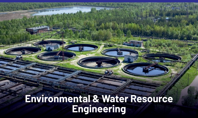
Environmental & Water Resource Engineering