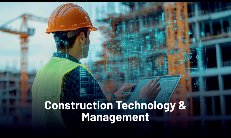
Construction Technology & Management